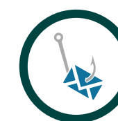
Phishing Email Reporting