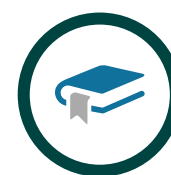
Course and Quiz Creation