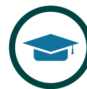
Personalized Learning Zone