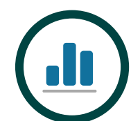
Dashboards and Reporting